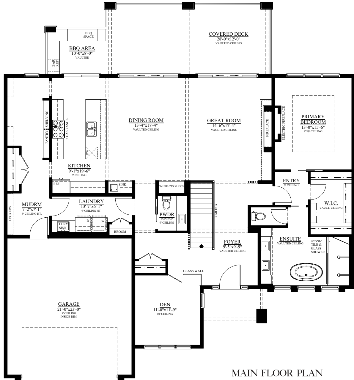
MAIN FLOOR PLAN 2,061 SQ. FT.

SALES TEAM 250-241-9444 SALES@EVERTONRIDGE.CA