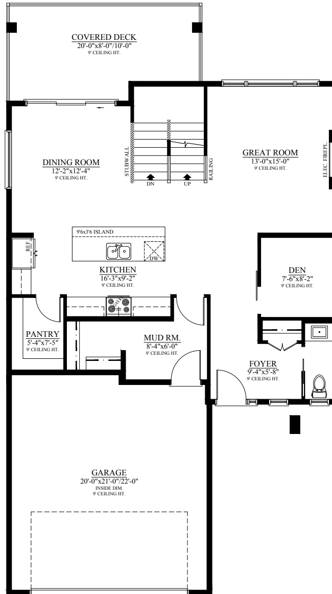
MAIN FLOOR PLAN 1,045 SQ. FT.

Everton Ridge Sales Team 250-241-9444 Sales@EvertonRidge.ca